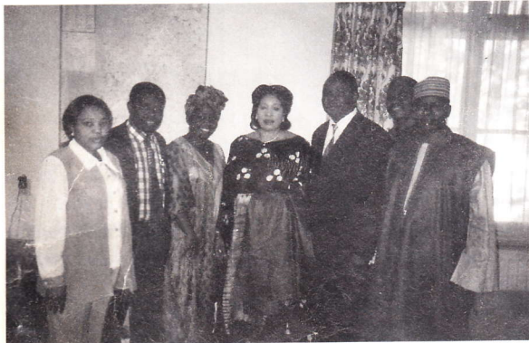
Reach Africa team with Mrs. Atiku after holding discussions