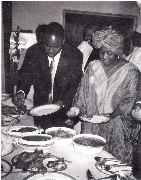
Time to eat with Her Excellency