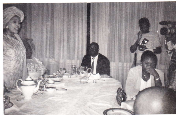
Her Excellency addressing the group